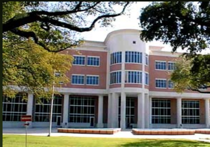
H. T. Sampson Library

Jackson State University is the fourth largest institution of higher learning in Mississippi and the only public four-year institution in the central Mississippi area.