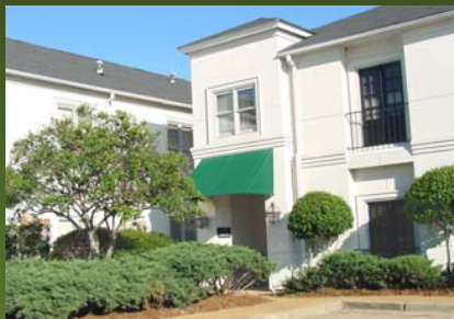
Mississippi Urban Research Center

The Mississippi Urban Research Center (MURC), a division of Jackson State University's Office of Research Development Support and Federal Relations, has a mission to improve the quality of life through the conduct of basic and applied research and policy analysis which contribute to current practices and provide insight on solutions to urban problems.