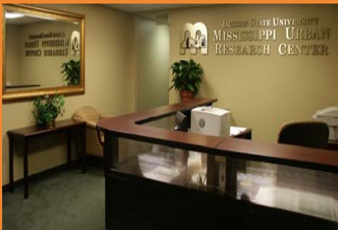
Mississippi Urban Research Center

The Mississippi Urban Research Center (MURC), a division of Jackson State University's Office of Research Development and Federal Relations, has a mission to improve the quality of life through the conduct of basic and applied research and policy analysis which contribute to current practices and provide insight on solutions to urban problems.