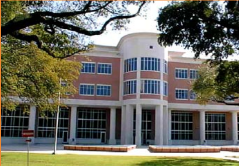
H. T. Sampson Library

Jackson State University is the fourth largest institution of higher learning in Mississippi and the only public four-year institution in the central Mississippi area.